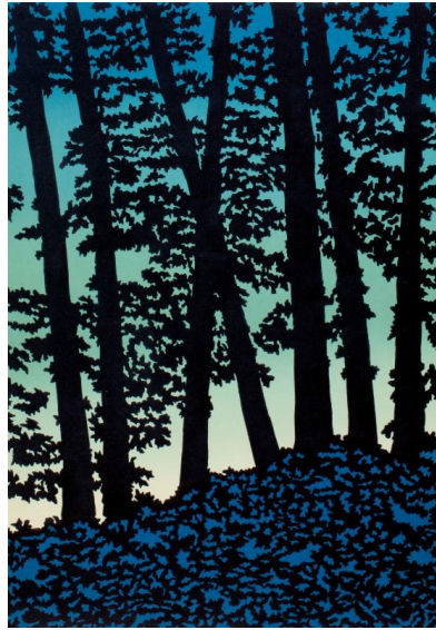
Image: Daryl V. Storrs, Blue Forest , 2009. Linocut. Purchase, Frances Hovey Howe Print Fund, 2014

Gallery talks are limited to 10 participants on a first-come, first-served basis.